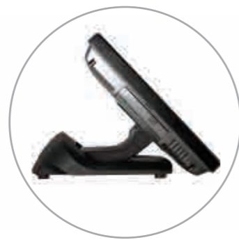
Low Profile Mode