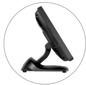
Full Extended Mode

The XT-4015 provides the selection of two foldable bases, the curvy slim GEN7E base and the larger but practical GEN8E base. The foldable base can be configured into "Flat Folded Mode" to save the shipping package volume, "Low Profile Mode" to allow greater interaction between the cashier and the customer, and the traditional "Full Extended Mode". All this can be achieved with a simple pull of the hidden lever.