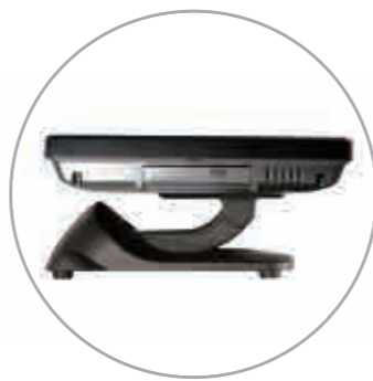
Flat Folded Mode