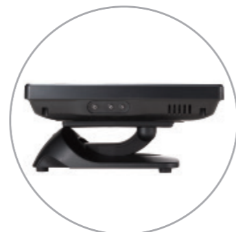
Flat Folded Mode