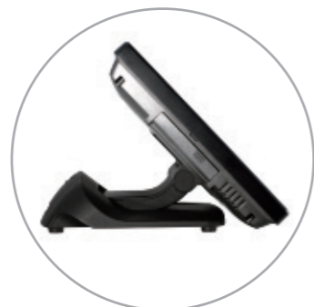
Low Profile Mode