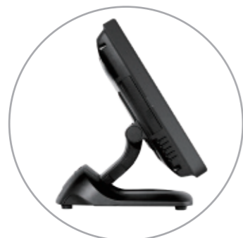
Full Extended Mode

The XT-3915 provides the selection of two foldable bases, the curvy slim GEN7E base and the larger but practical GEN8E base. The foldable base can be configured into "Flat Folded Mode" to save the shipping package volume, "Low Profile Mode" to allow greater interaction between the cashier and the customer, and the traditional "Full Extended Mode". All this can be achieved with a simple pull of the hidden lever.